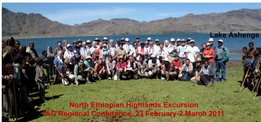
Fig. 4. Participants in the Post-Conference Excursion.

Nine participants extended their excursion to the Danakil Depression between 1-4 March 2011 and nineteen other participants extended their excursion to the Simien Mountains, Lake Tana and Lalibela between 3-9 March 2011. One-day Mid-conference excursions to the Blue Nile Gorge, attended by 85 participants, and to Melka Kunture/Tiya attended by 15 participants were greatly appreciated by participants. All the excursions were successfully completed as per schedule.