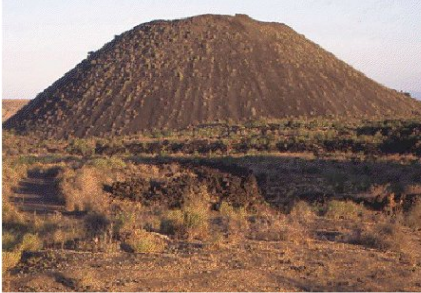
Fig. 2. A Quaternary scoria cone in the Afar Rift.

The “Landmap Intensive Course on Landslide Mapping” was conducted in Dessie town, Northern Ethiopia between 14 and 18 February 2011 and was attended by thirteen young geomorphologists, six of whom were sponsored by the IAG (Fig. 3).