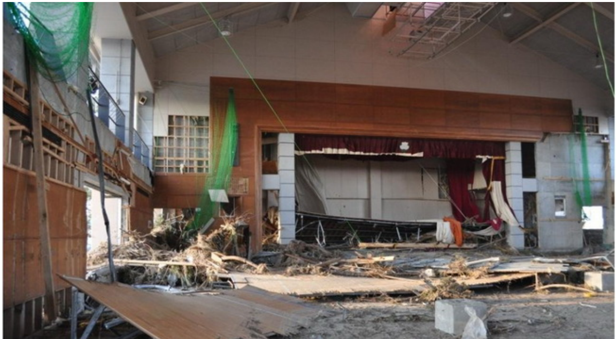
5. Nakahama Elementary School, Yamamoto Town: Many schools were damaged like this.