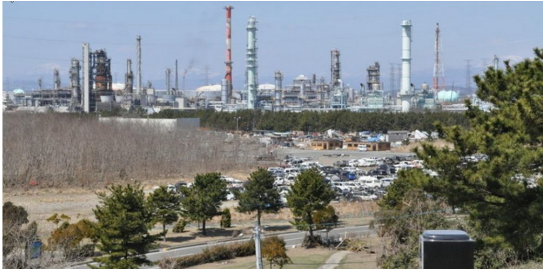
2. Sendai Oil Refinery: The left part was set on fire with huge smoke. The damage to this facility was partly responsible for the shortage of gas and fuel during the first two weeks