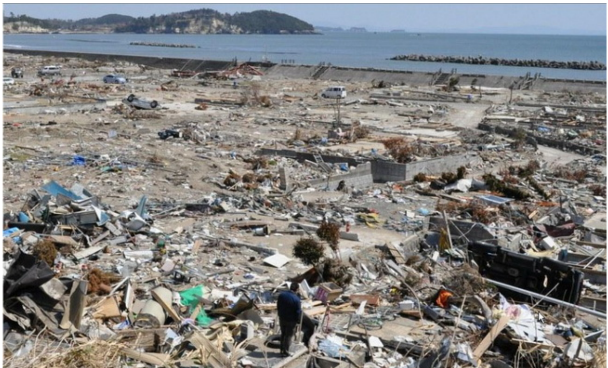
3. Shobuta Beach 1, Shichigahama Town: You can imagine the beauty of this beach and the sadness of the standing man.