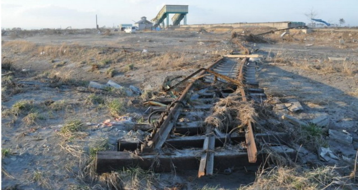
6. Sakamoto Station and Joban Railway, Yamamoto Town: This is one of many stations destroyed by tsunami.