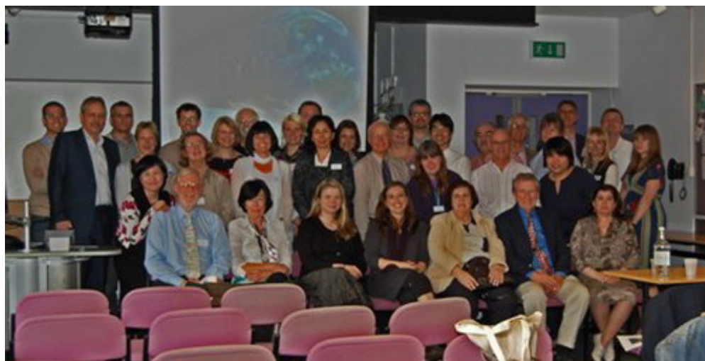
Participants in the IGU CGE London 2011 Symposium