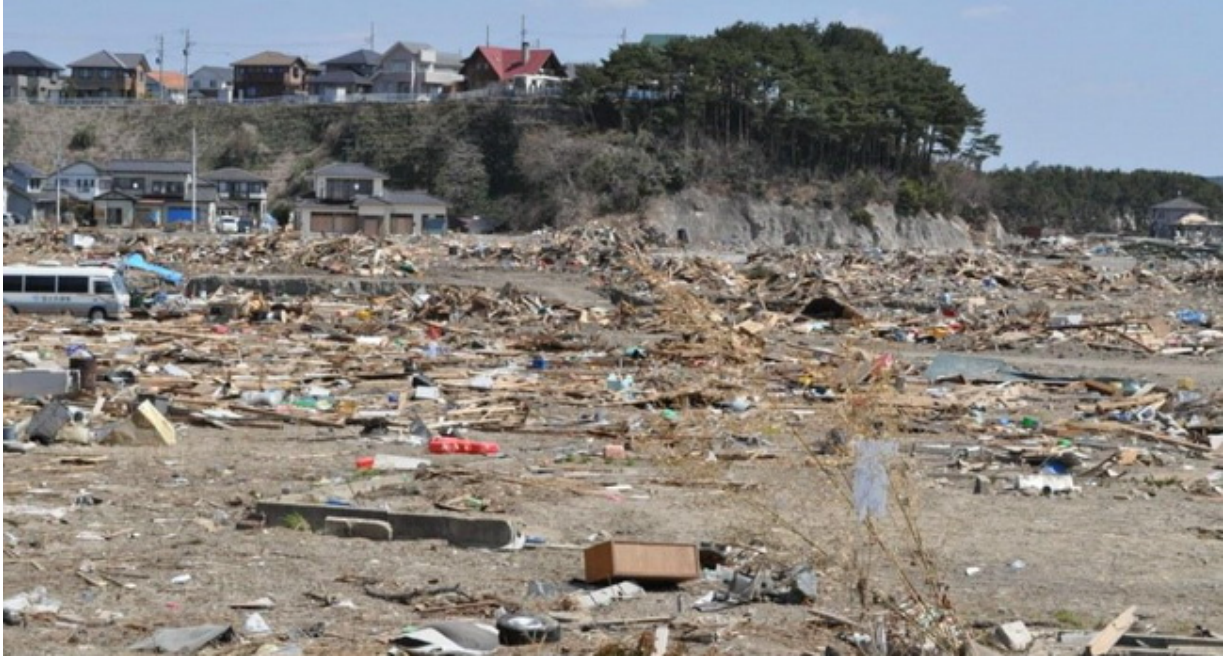
4 - Shobuta Beach 2, Shichigahama Town: The houses on the plateau are undamaged.