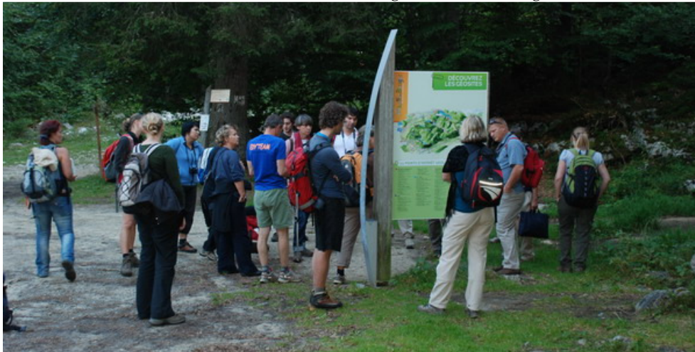
Karst and caves geotrail in Margeriaz (tannes is the local denomination of karst caves where people used to gather snow in winter, then taking down to villages when needed)