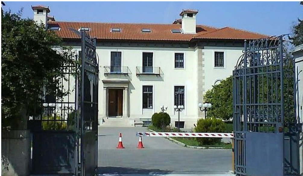
Harokopio University Athens, main building

The participation of established and young researchers in this Colloquium and the presentation of very interesting papers indicates the research dynamism in the areas of Quantitative and Theoretical Geography. We hope that this opportunity of interaction between established and young researchers from around the world will contribute to the evolution of Quantitative and Theoretical Geography.