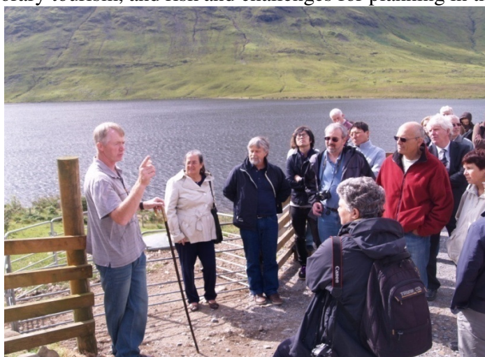
Discussing farm diversification during a visit to a sheep farm at Loughnafoey, County Galway

Field based learning activities were organised on two full days and one afternoon and evening, as is customary for this Commission, with discussion being led by local colleagues and external specialists. On the afternoon of Wednesday 3 August, the group visited the ‘creative’ film and television related cluster at Indreabhán, west of Galway, learned about residential pressure in the urban fringe in Bearna and had a post dinner guided walk along the waterways in the city. Field visits on Thursday 4 August, to south County Galway and County Clare, were devoted to Brazilian labour immigration, the work of a Local Development Company and Wood Energy Project, conservation in the karstic landscape of the Burren, and tourism development in the context of the Cliffs of Moher. The issues discussed on Friday included language and development in the Gaeltacht (Ireland’s officially designated areas where the majority of the population speak the Irish language as well as English), farm diversification, 19 th century famine landscapes, contemporary tourism, and risk and challenges for planning in the coastal zone.