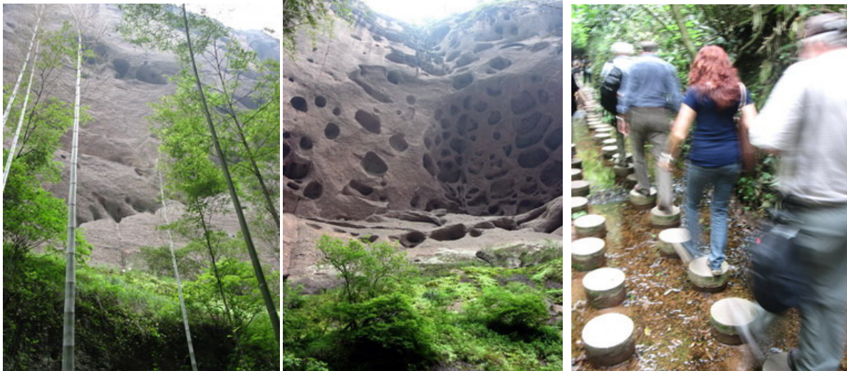
Excursion in the Geopark: towering bamboos, wind erosion, difficult paths