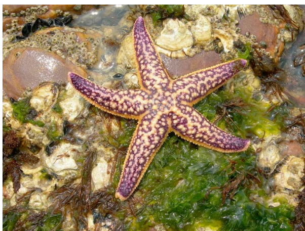
Figure 2. The sea-star Asterias amurensis .